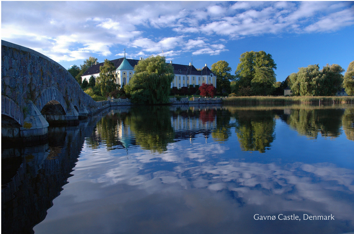
Gavnø Castle, Denmark