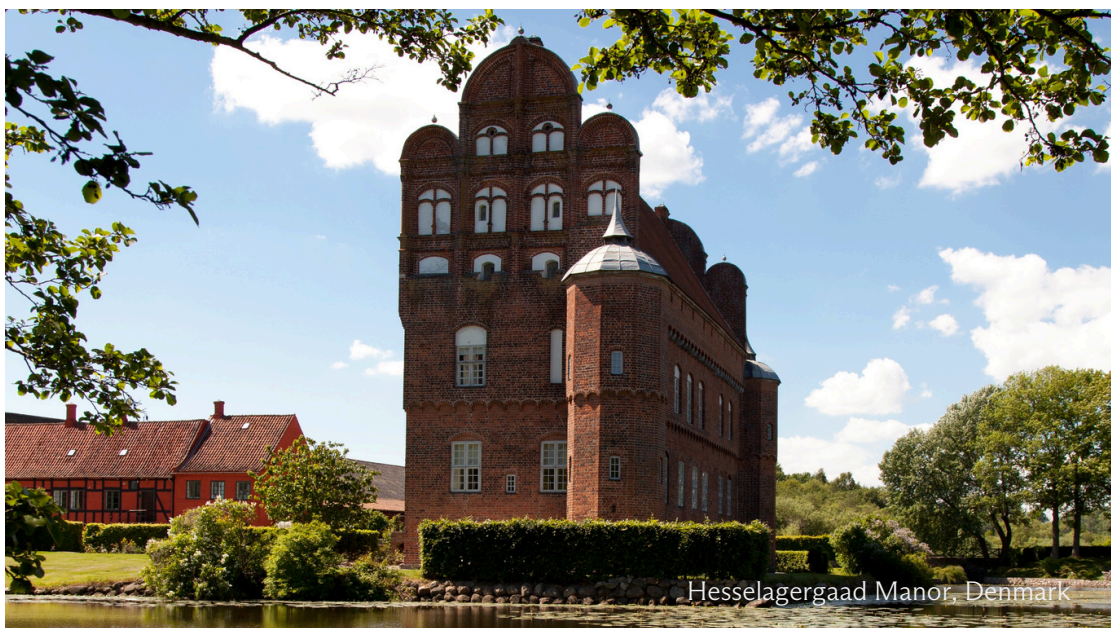
Hesselagergaard Manor, Denmark

As organisers, EHH provides a liability insurance for the attendees during the events. The travel and health optional insurances are left to the participants' discretion.