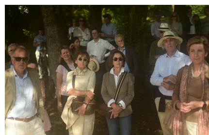
2 nd edition Ascoli Piceno, Italy. 2024