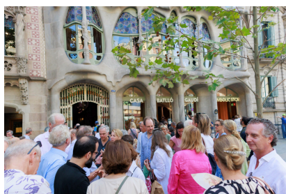
3 rd edition Barcelona, Spain. 2025