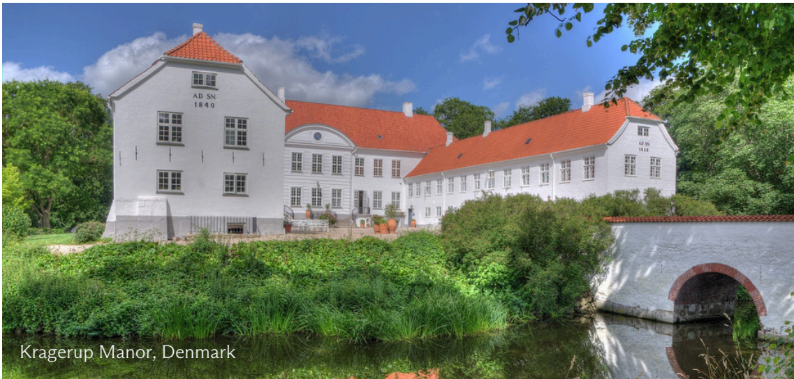
Kragerup Manor, Denmark