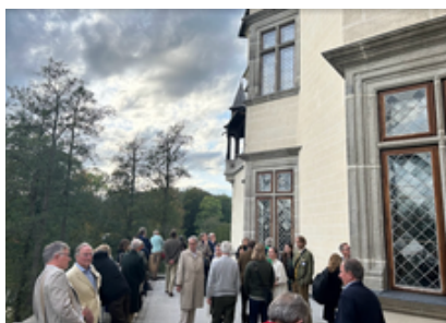
1 st edition Prague, Czechia. 2023