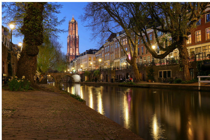
The Bailiwick of Utrecht; Utrecht City