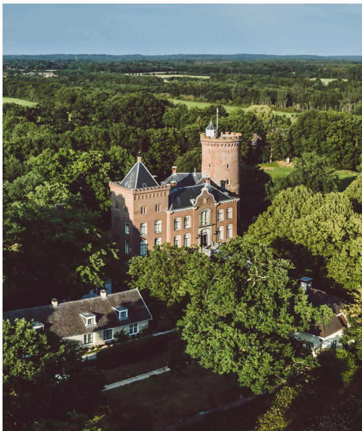
Picture: Castles Vredenhoff, Gunterstein and Sterkenburg