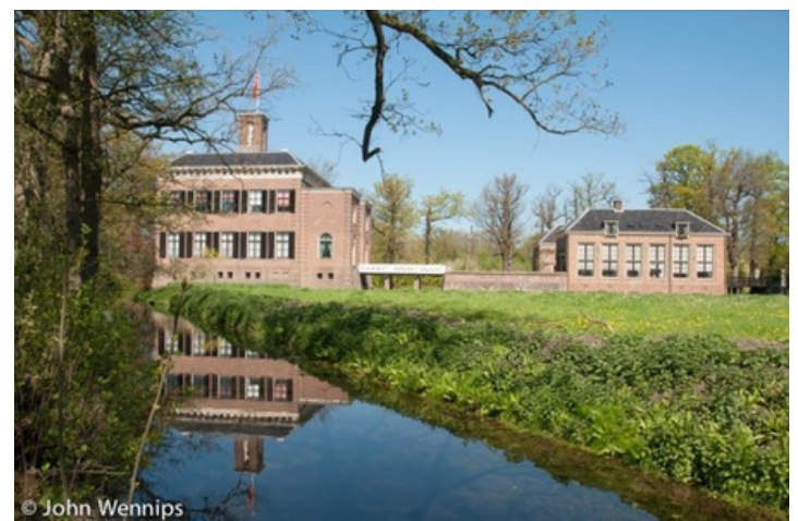
Picture: Castles Vreedenhoff and Gunterstein